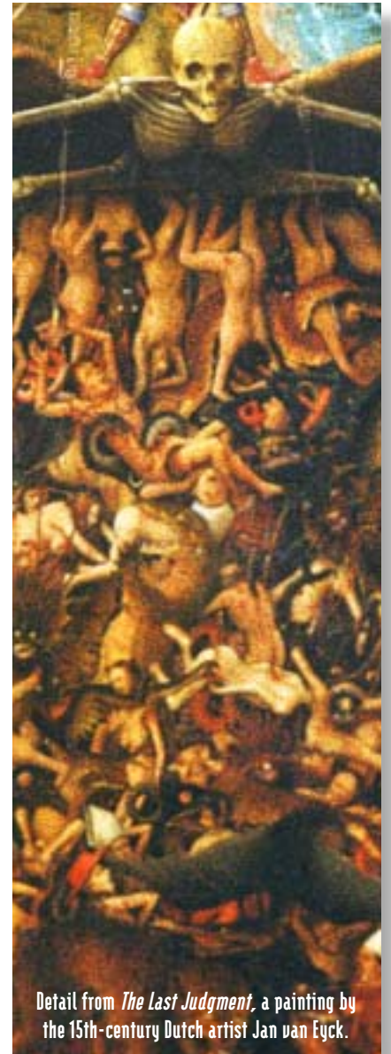
Detail from The Last Judgment , a painting by the 15th-century Dutch artist Jan van Eyck.

That may be one reason why Christianity is having such a battle with hell today. Humans today consider themselves to be more