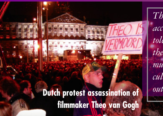
Dutch protest assassination of filmmaker Theo van Gogh

The historic Dutch multi-cultural acceptance of religious and cultural tolerance was shaken to its core with the murder of van Gogh. Before his murder any criticism of Muslim culture was generally regarded as outright racism in tolerant Holland.