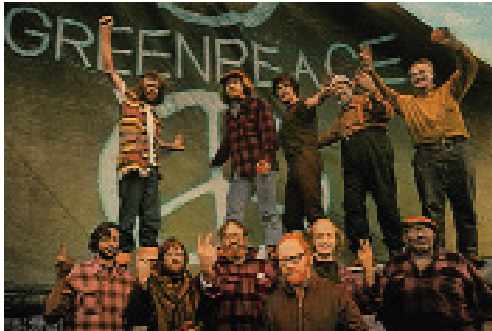
Crew of the Phyllis Cormack , first Greenpeace trip to Amchitka Island to protest nuclear weapons testing.

We don't have to give up what we believe is truth, but we must recognize that we don't possess all truth. Truth is ultimately owned by God alone. We humans are shortsighted, short-lived pilgrims passing through this third rock from the sun.