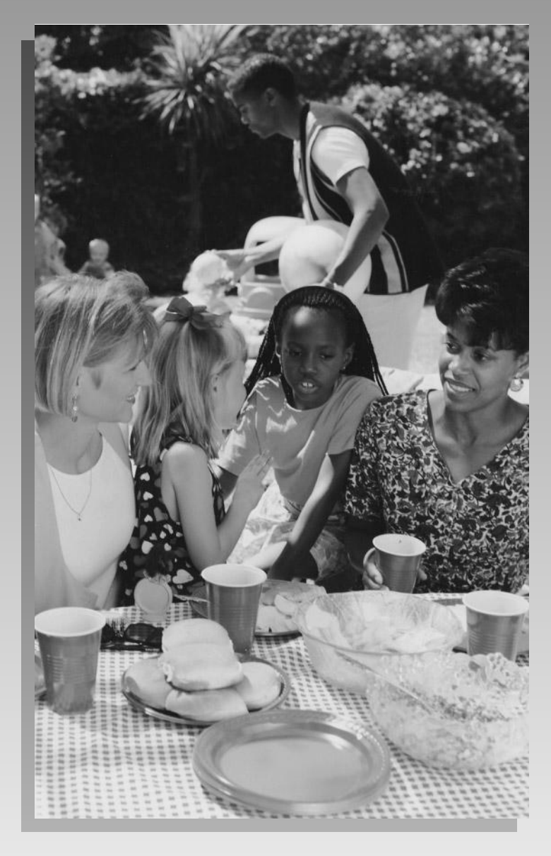
"Love your neighbor as yourself.' Love does no harm to its neighbor. Therefore love is the fulfillment of the law." Romans 13:9-10