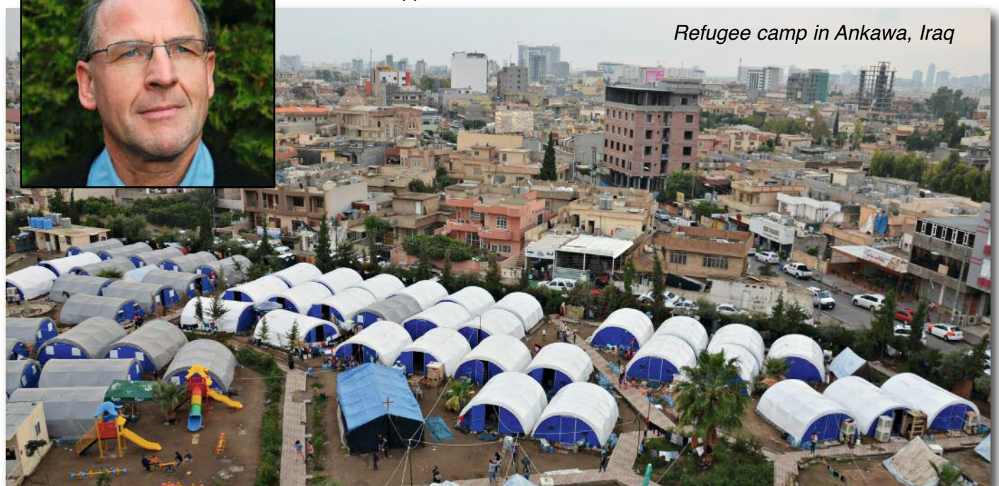
Refugee camp in Ankawa, Iraq