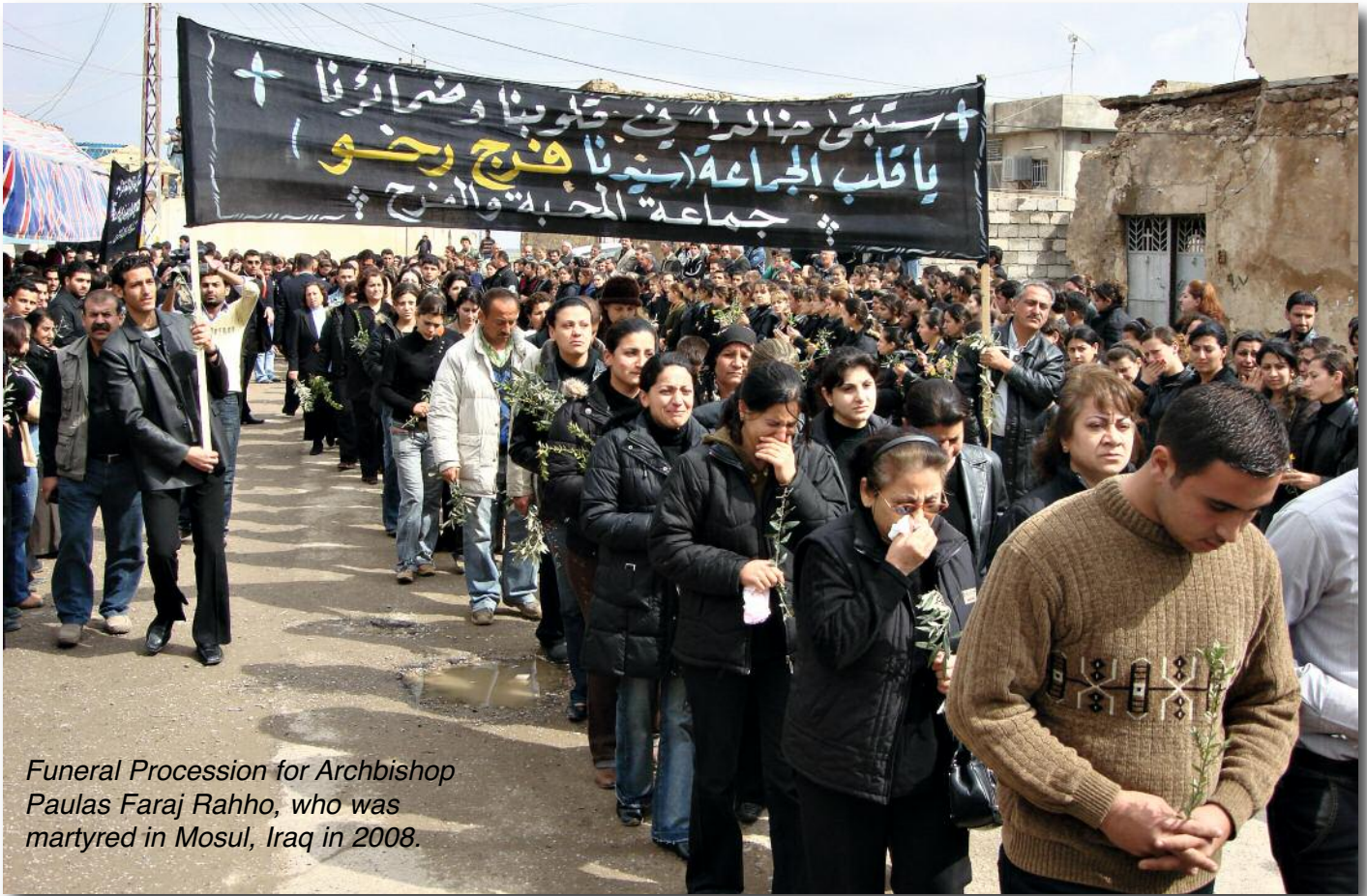
Funeral Procession for Archbishop Paulas Faraj Rahho, who was martyred in Mosul, Iraq in 2008.

and Damascus. They still use the language of Jesus in their liturgies—and some of them in everyday speech. The old Syriac churches spread over a large region that today comprises Palestine, Lebanon, Syria, Iraq and southeast Turkey.