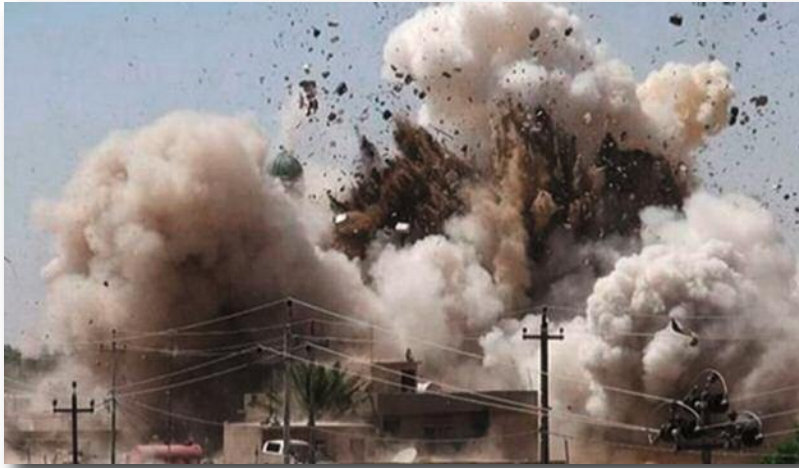
Destruction of Mar Gorgees Church, Mosul, Iraq

CWRm: Following these events in the media is confusing to us. What should we watch and listen for that might bring clarity?