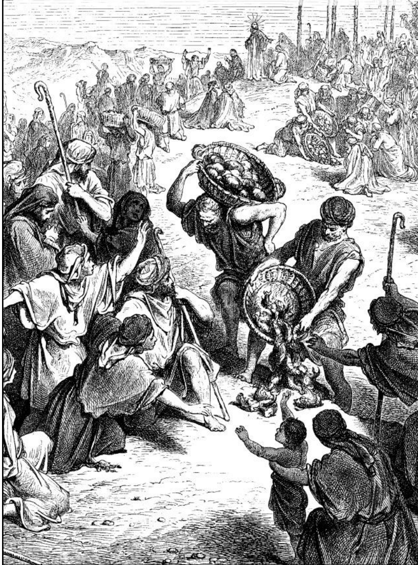
Artwork by Gustav Doré